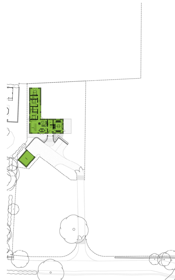
Approved Site Plan